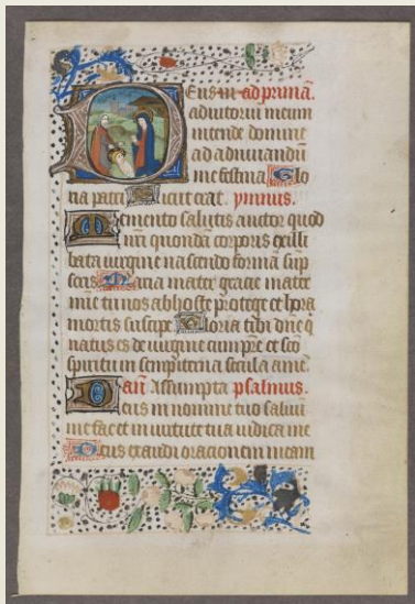
The Book of Hours, (German, 14th. c), Takamiya collection, Borthwick Institute